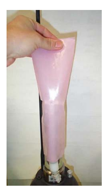
IMPORTANT: Remove plastic bag and three plugs from CTD sensor, if they have not already been removed.

1. Secure float in horizontal position, using foam cradles from crate.